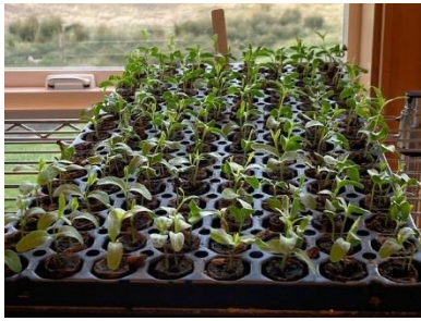
Asclepias fascicularis. 6/30/2025. 22 days after cold stratification.