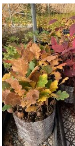
White Oak Farm Nursery.

Plugs must be packaged to prevent plugs from tipping over and being damaged during transport. Kintigh Nursery uses square (gusseted) 1.5 mm bags with open tops. White Oak Farm Nursery uses plastic wrap.