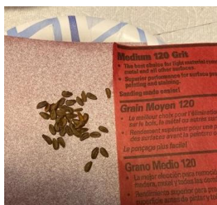
SC2. Scarification with light sanding between two pieces of 120 grit sandpaper, followed by water soak.