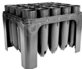
D30 cells (left photo) and D40 cells (right photo) are both supported in D20T trays. The D30 cells are elevated higher in the D20T tray than the D40 cells.