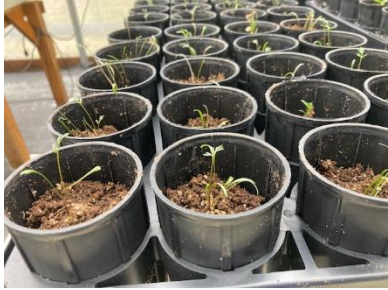
7/2/2025. Start active growth