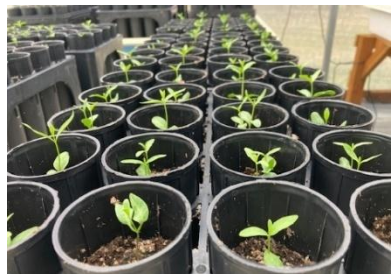
BMMN. 50 mm x 200 mm Earth Pots in D40H cells. No loose media added.

During year 1 of the Tom Landis research project, loose media was added to the bottom of Deepot 40 (D40) containers prior to inserting the 50 mm x 200 mm Earth Pot plugs due to concern that the 10-inch containers were too long for the 8-inch Earth Pot plugs. In year 2, shorter, 8-inch long Deepot 30 (D30) containers are being used. However, excellent results were obtained by BMMN with the D40 containers, and no loose media was added to the bottom of containers (photos follow). There is 1.25" to 1.5" gap between top of plug media and top of container. Heavy duty, D40H containers were used by BMMN and have a different shape than the light D40L containers, which may make a difference. D30 containers sit higher in the D20T trays and bottom-up watering could be an issue in standard flood trays. The 50 mm x 200 mm Earth Pot plugs have 40 ci volume, but Landis indicated no issue with fit in D30 (30 ci) containers.