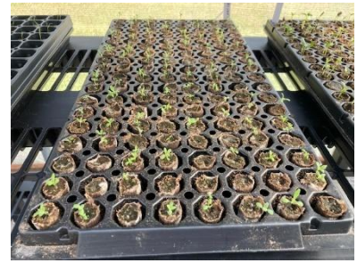
Eriophyllum lanatum. 6/26/2025. 18 days after cold stratification.