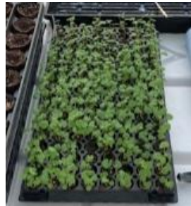
Drymocallis glandulosa. 7/17/2025. 25 days after cold stratification.