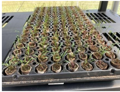
Domatium utriculatum. 6/26/2025. 18 days after cold stratification.