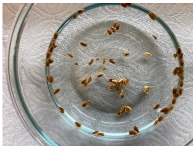
SC1. 1% hydrogen peroxide soak followed by water

Methods SC1, SC2, SC3 were used only for Asclepias fascicularis seeds. Coffee filter was used to strain seeds after soaking in water or hydrogen peroxide.