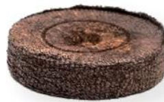
Compressed-media disk in plastic net

Q Plugs are used for cold stratification and the establishment phase of plug propagation of native plants at the USFS Dorena Genetic Resource Center in Cottage Grove, Oregon. Earth Pots are used for plug propagation of native plants at the White Oak Farm & Education Center, Williams, Oregon. Earth Pots and Jiffy Pellets are currently being evaluated for propagation of native milkweed plugs through a research project being coordinated by Tom Landis, retired USDA. Kintigh Nursery uses Ellepot plugs for propagation of conifer trees.