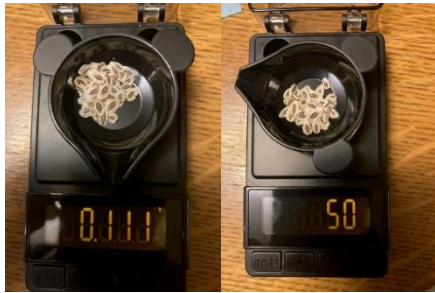
Weight and seed count for Lomatium utriculatum

BMMN used a milligram scale to weigh seed samples in range of approximately 50 to 150 seeds (depending on seed size). The number of seeds were counted for each sample. Table 6 provides a comparison between published densities and measured densities by BMMN.