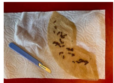
SC3. Scarification with sandpaper, cut off tip at radicle end of seed with scalpel, followed by water soak.