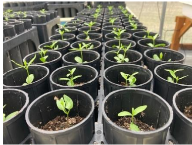
7/1/2025. Start active growth