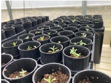
7/3/2025. Start active growth