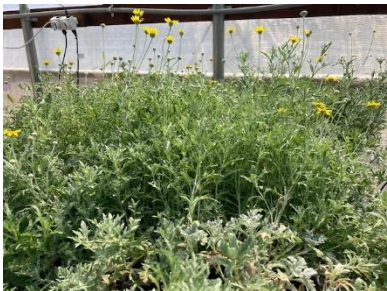
9/6/2025. Plants flowering.