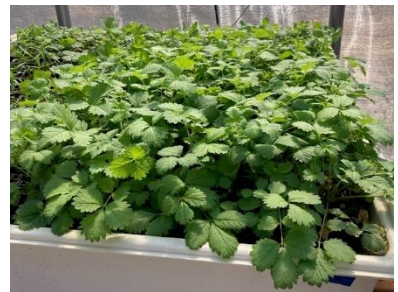
9/06/2025. Dense vegetative growth