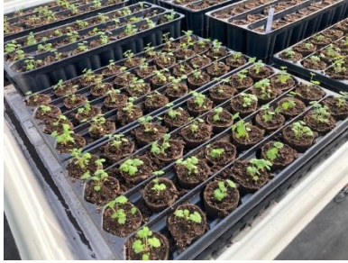
7/26/2025. Start active growth