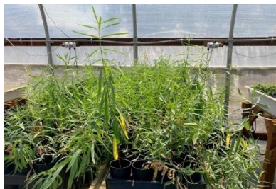
9/06/2025. Senescence 8/31/2025, minor browning leaves.