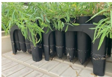
BMMN. D40H cells in D20T trays. Note water line mark on containers from bottom-up watering in standard depth flood