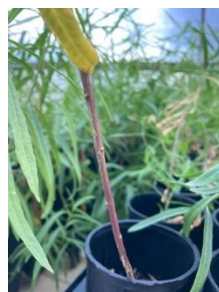
9/21/2025. Stems turning color