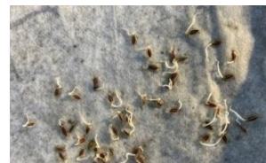
Germination of Lomatium utriculatum during cold stratification

Seeds of some species will germinate during cold stratification. Both Lomatium utriculatum and Eriophyllum lanatum had seeds start to germinate in cold stratification. There are different strategies to address germination during cold stratification. The best strategy BMMN found during 2024 and 2025 pilots is to end cold stratification when germination is observed during cold stratification.