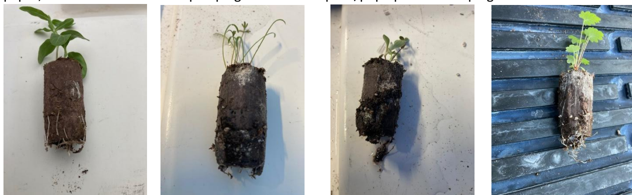
Asclepias fascicularis . 23 days after cold stratification

Chop stick was sometimes necessary to help remove mini plugs from Blackmore trays without tearing paper; narrow end to loosen top of plug or flat end to push/pop up bottom of plug.