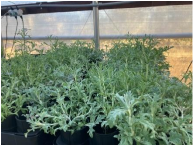
8/15/2025. Dense vegetative growth