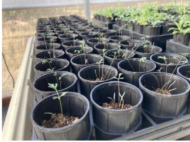
7/26/2025. Senescence observed in some seedlings.